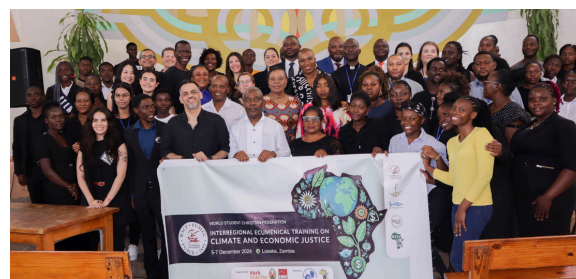
Advocacy Training and ExCo Meeting in Zambia