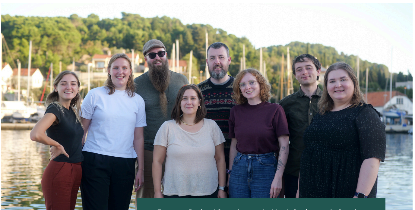
European Regional Committee at the Youth Conference in Croatia