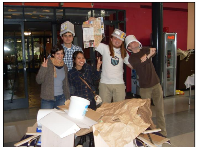
Students playing a role play about the geopolitical system and human needs at the Theology Conference in Berlin, Germany