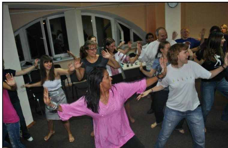
Dancing during the Stop Being Silent! Lingua Franca Training in Minsk, Belarus.