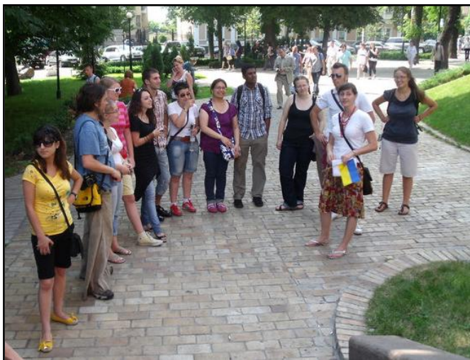
Excursion in Kiev, Ukraine during the Shared Eucharist Lingua Franca Training