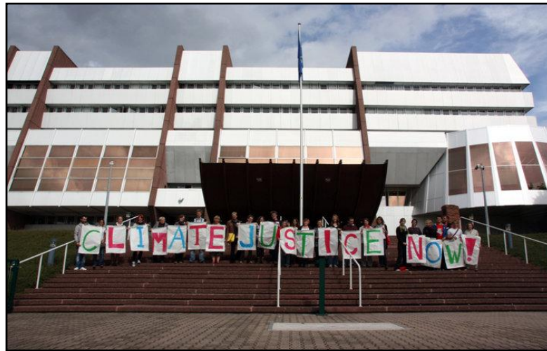
EYCE – WSCF-E Joint Study Session in Strasbourg, France